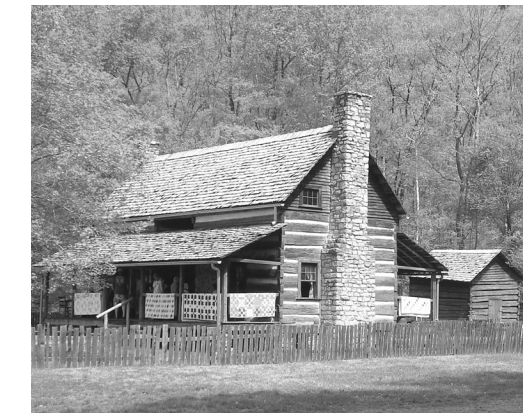
Homeplace 1850s Working Farm 29 Miles | 38 Minutes from Hillman Ferry