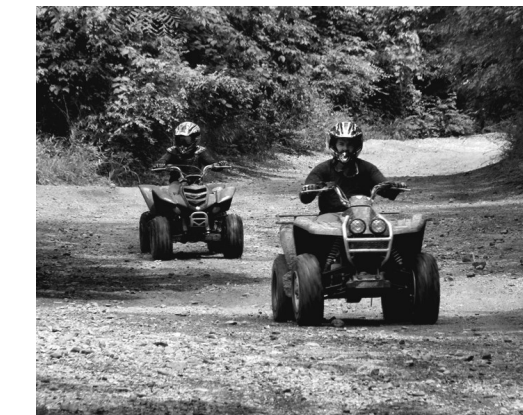
Turkey Bay Off-Highway Vehicle Area 20 Miles | 26 Minutes from Hillman Ferry