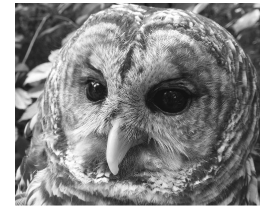
Woodlands Nature Station 11 Miles | 18 Minutes from Hillman Ferry