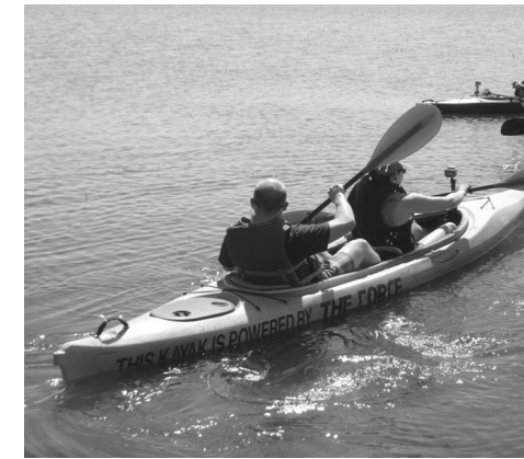
Brandon Spring Group Camp 38 Miles | 49 Minutes from Hillman Ferry Reservations required: 931.232.7405

Weather: Inclement weather, such as thunderstorms, excessively high winds, ice/snow, etc. can occur with little to no notice. When these events are predicted/occur, please take appropriate precautions such as closing awnings, securing loose items, taking down/staking sunshades, etc. Contact gatehouse for guidance about weather events.