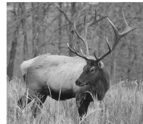
Elk & Bison Prairie 16 Miles | 20 Minutes from Hillman Ferry