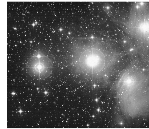
Golden Pond Visitor Center, Planetarium & Observatory 18 Miles | 23 Minutes from Hillman Ferry